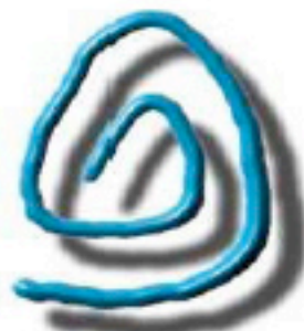
(U) LBLogo aka "Little Boy Lover"