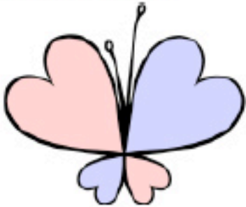
(U) CLogo a.k.a. "Child Lover"