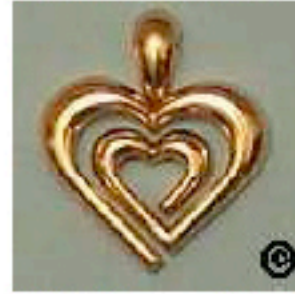
(U) GLogo Pendant

(U) The ChildLover logo (CLogo), as shown below, resembles a butterfly and represents non-preferential gender child abusers. The Childlove Online Media Activism Logo (CLOMAL), also represented below, is a general purpose logo used by individuals who use online media such as blogs and webcasts. 4