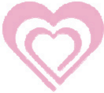
(U) GLogo a.k.a. "Girl Lover," Childlove