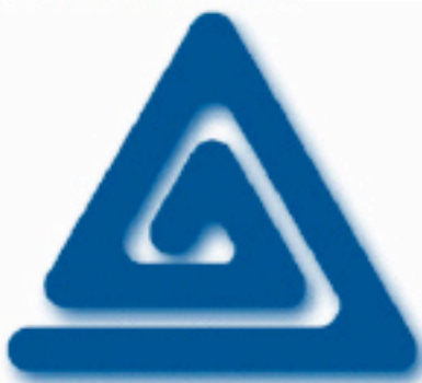
(U) BLogo aka "Boy Lover"