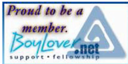
(U) Boylover.net banner